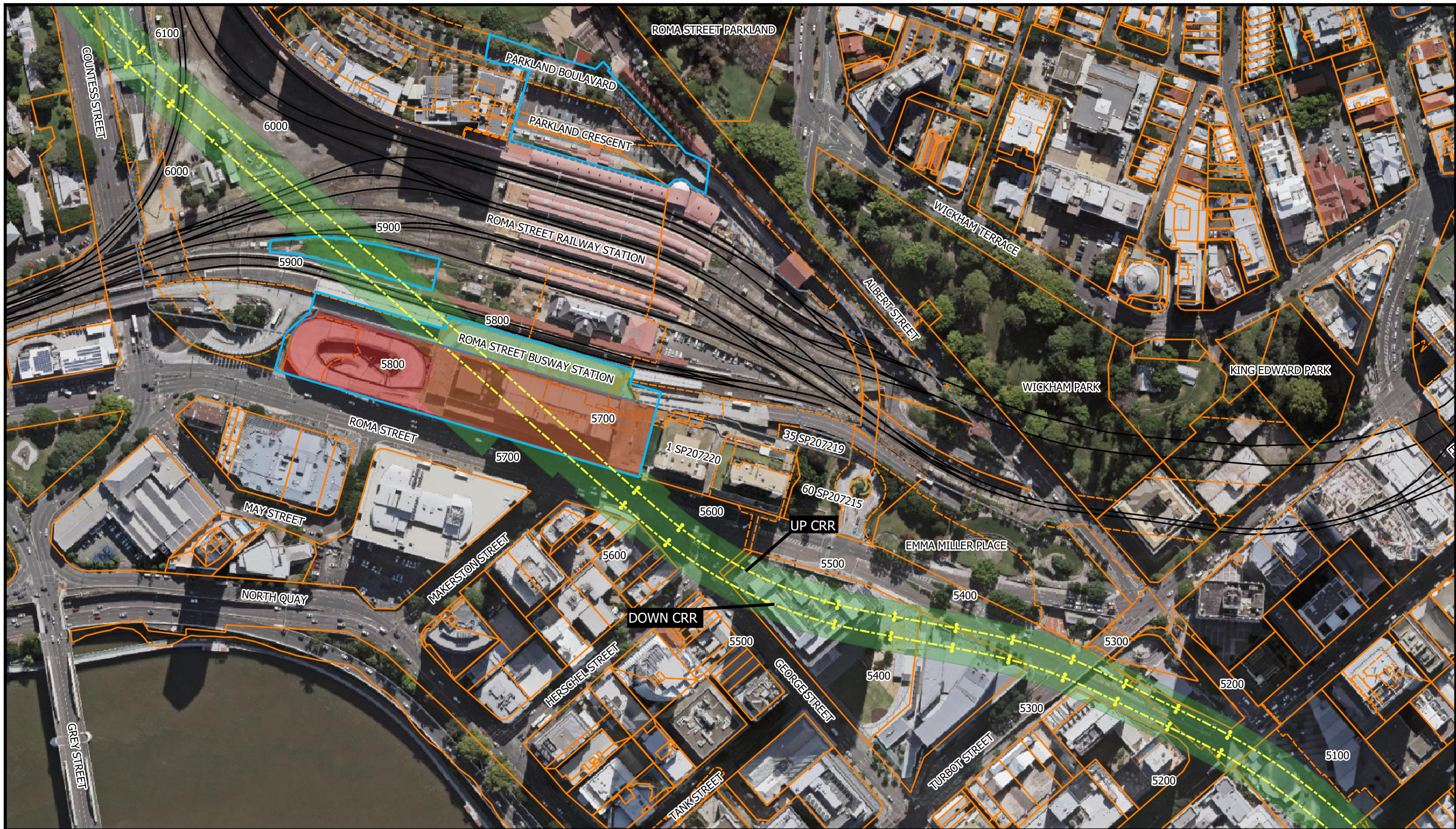
Figure 2: Approved Property Impact Plan